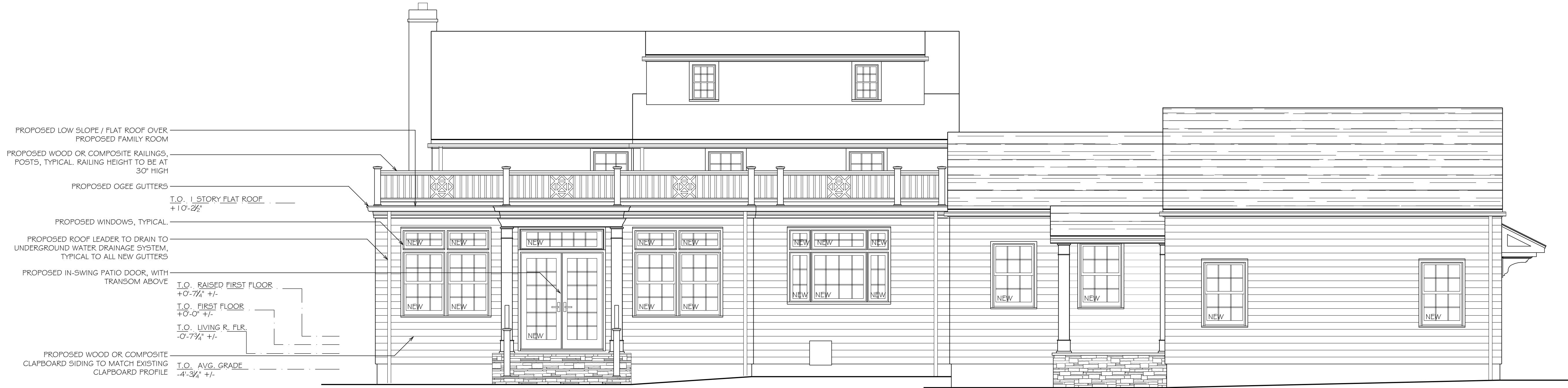
1 PROPOSED WEST ELEVATION SCALE: 1/4" = 1'-0"