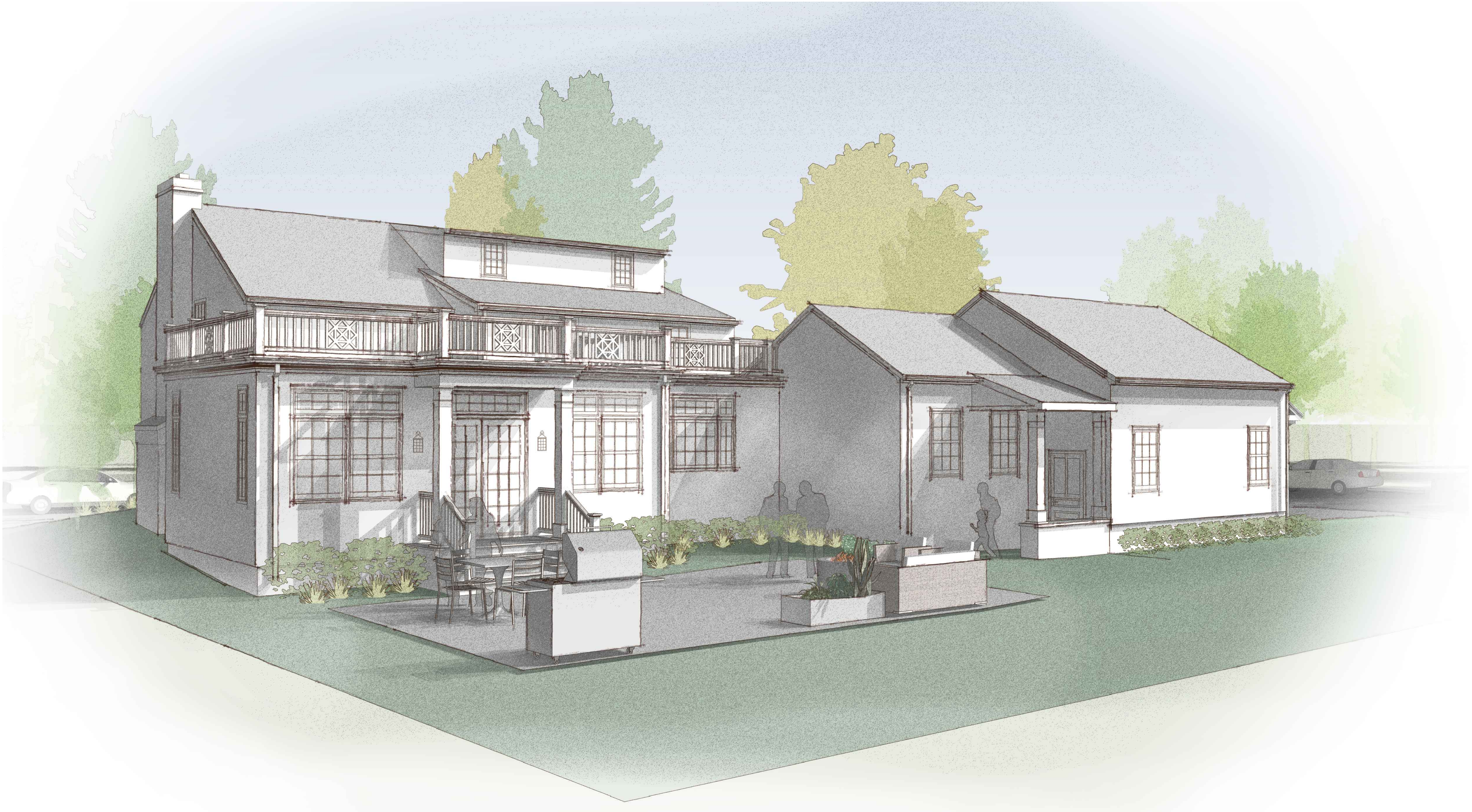
1 COLORED RENDERING SCALE: N/A