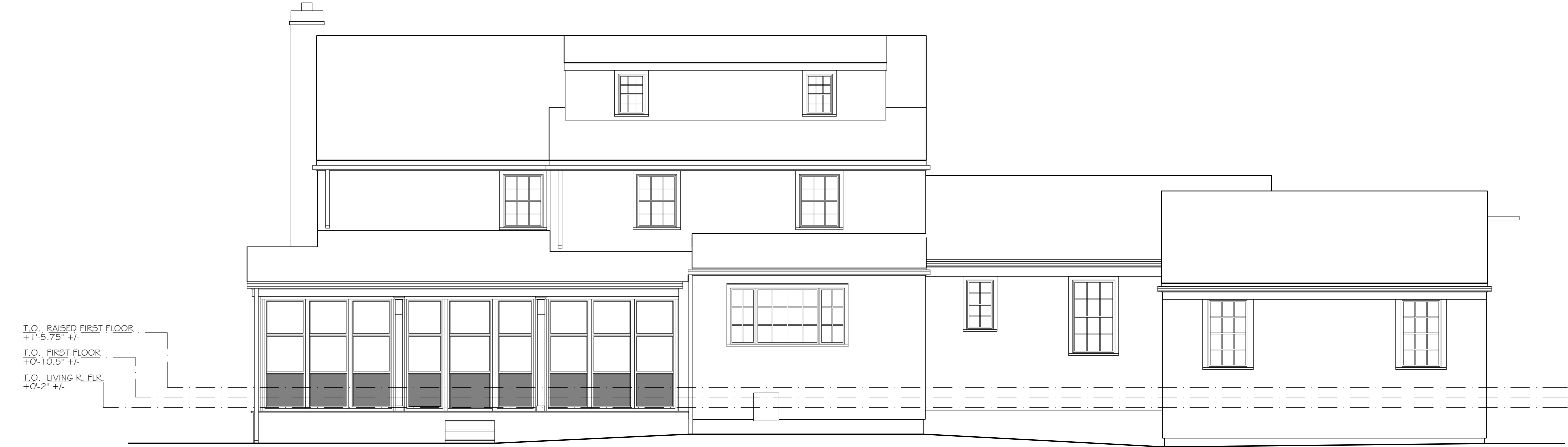
2 EXISTING WEST ELEVATION SCALE: 1/4" = 1'-0"