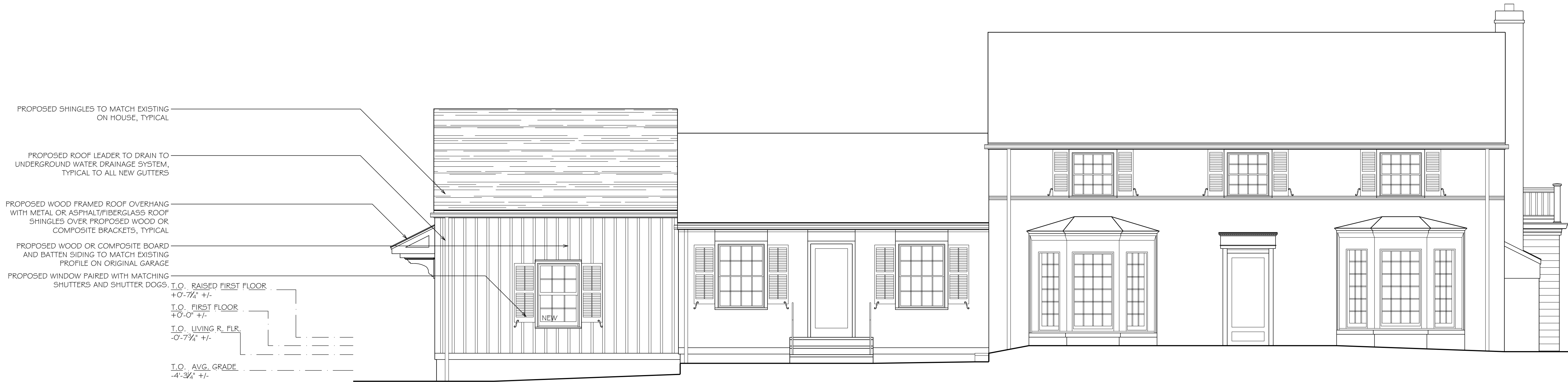
2 PROPOSED EAST ELEVATION SCALE: 1/4" = 1'-0"

SUNROOM AND GARAGE RECONSTRUCTION TO THE SINGLE FAMILY DWELLING 144 ELMWOOD ROAD VERONA, NEW JERSEY