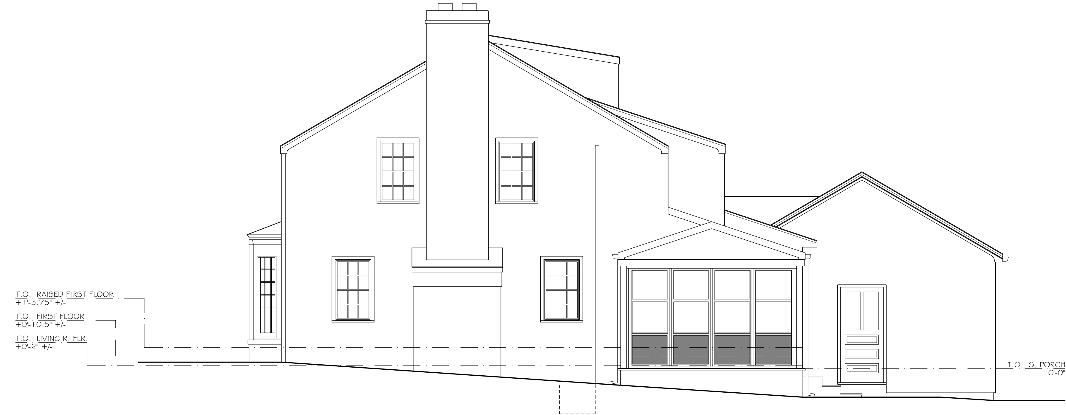
2 EXISTING NORTH ELEVATION SCALE: 1/4" = 1'-0"