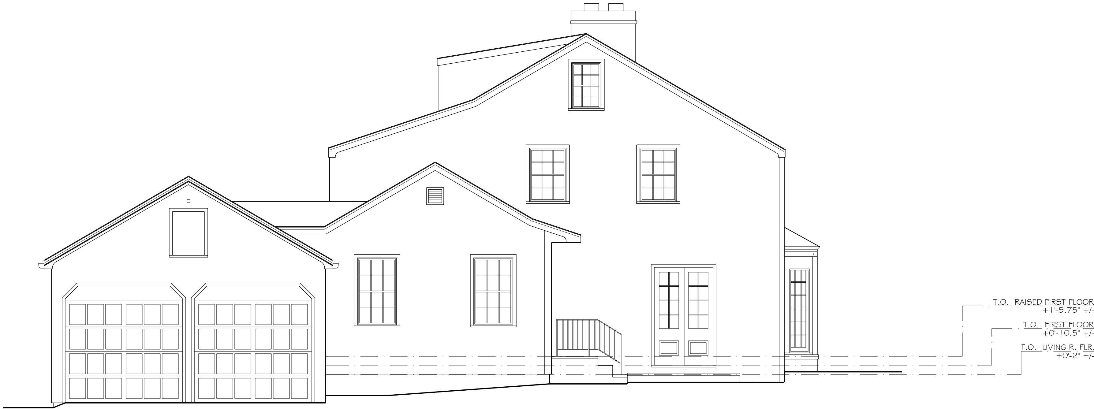
1 EXISTING SOUTH ELEVATION SCALE: 1/4" = 1'-0"