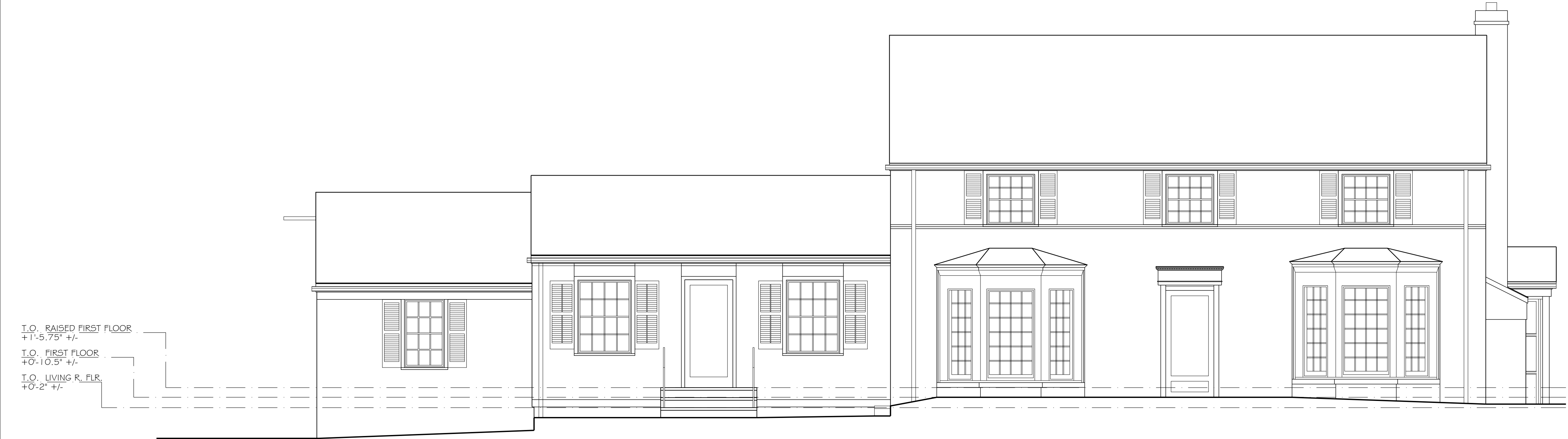
1 EXISTING EAST ELEVATION SCALE: 1/4" = 1'-0"